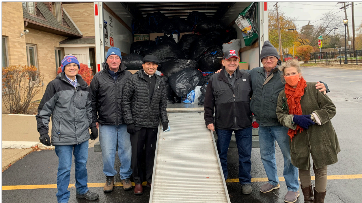
Sharing Board members and volunteers collect food and coats at the Fall Food Drive.

The generosity of Saint Anne parishioners is greatly appreciated by our sharing partners. Please continue to help those in need by supporting Parish Sharing through the Gold/Sharing envelopes or through electronic donations via Give Central.